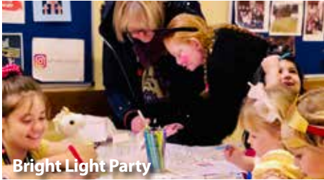
Bright Light Party