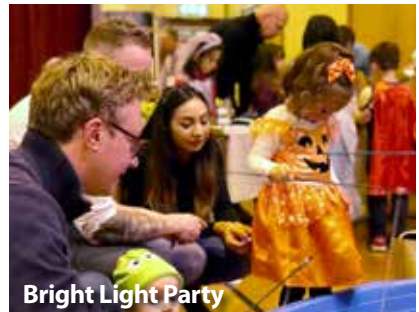
Bright Light Party