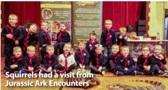
Squirrels had a visit from Jurassic Ark Encounters