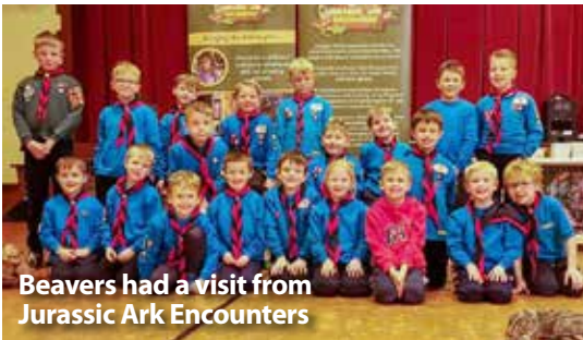
Beavers had a visit from Jurassic Ark Encounters