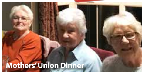
Mothers' Union Dinner