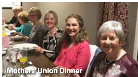
Mothers' Union Dinner