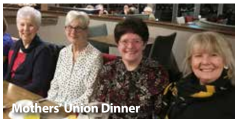
Mothers' Union Dinner