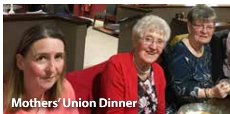
Mothers' Union Dinner