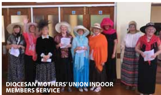
DIOCESAN MOTHERS' UNION INDOOR MEMBERS SERVICE