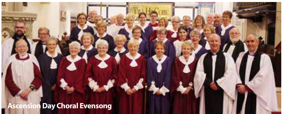
Ascension Day Choral Evensong