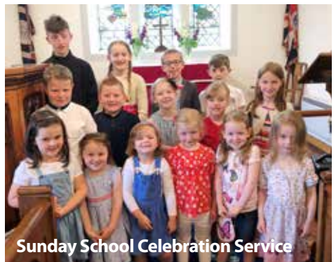
Sunday School Celebration Service