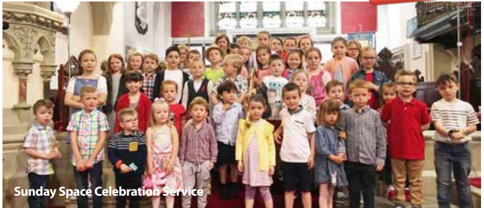
Sunday Space Celebration Service