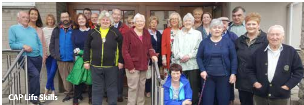
CAP Life Skills