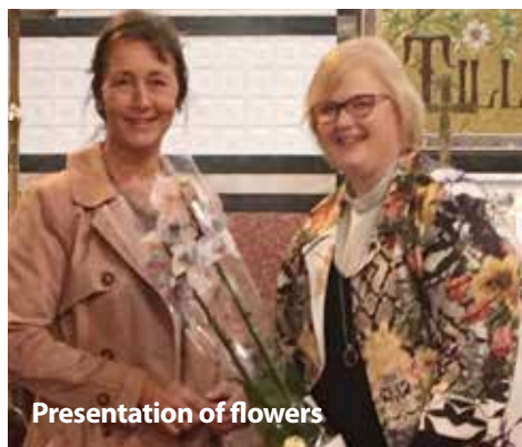
Presentation of flowers