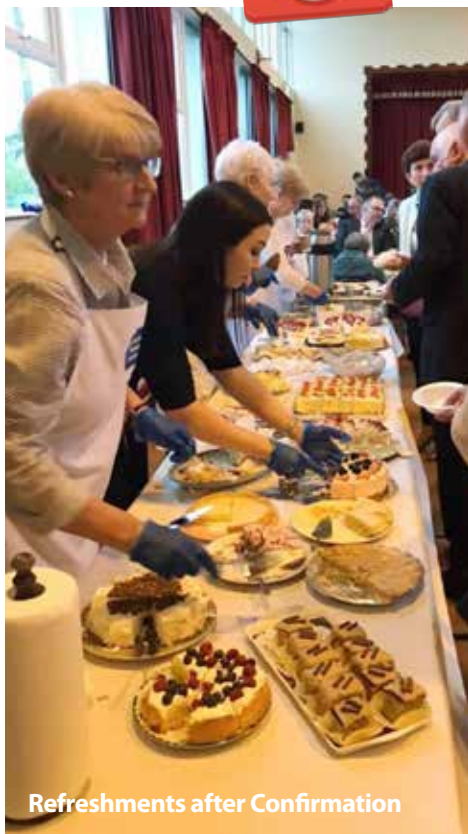
Refreshments after Confirmation