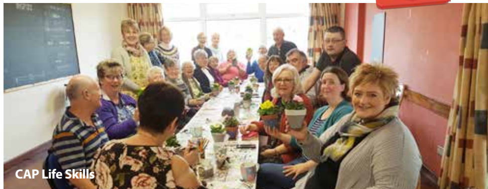
CAP Life Skills