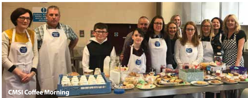
CMSI Coffee Morning