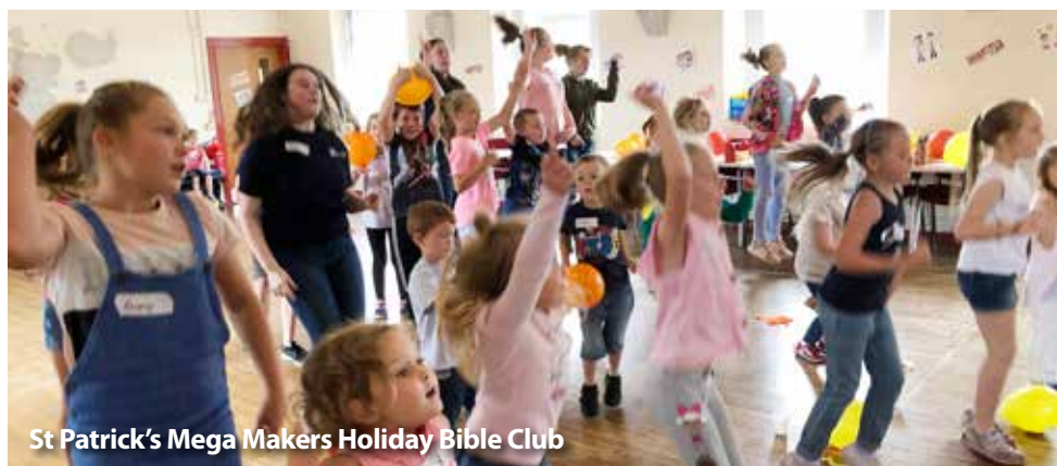
St Patrick's Mega Makers Holiday Bible Club