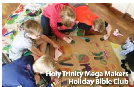
Holy Trinity Mega Makers Holiday Bible Club