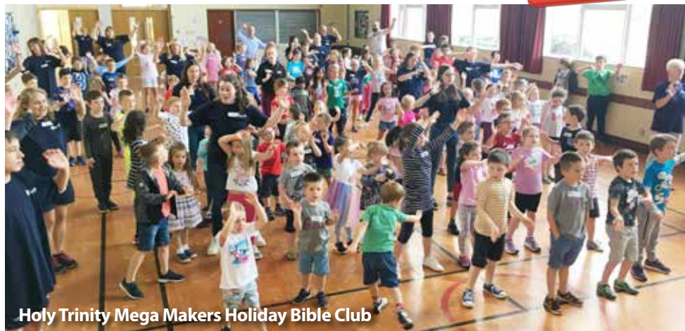
Holy Trinity Mega Makers Holiday Bible Club