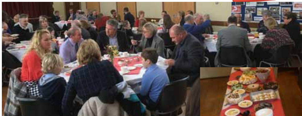
LUNCH WITH THE KING